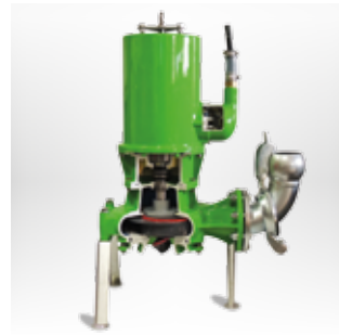
MAGNUM CSPH Submersible motor pump gear unit design