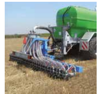
Slurry injector Innovative spreading technology