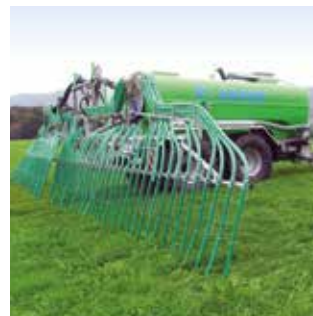
Trailing hose applicator Modular system for all types of tankers