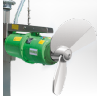
MSXH Submersible motor mixer