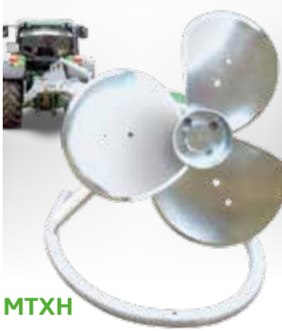
MTXH Tractor mixer