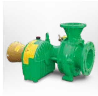
MAGNUM SM Thick matter pump gear unit design