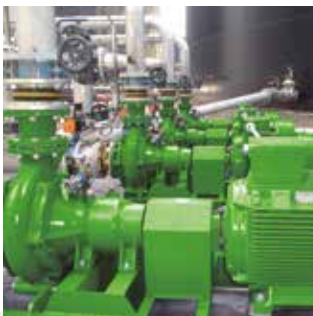
MAGNUM SX Thick matter pump gear and pedestal pump