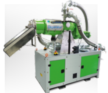
SEPARATOR PLUG & PLAY System for portable slurry separation