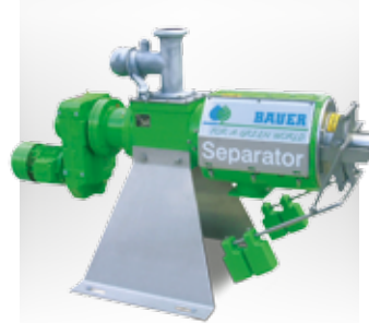
SEPARATOR Press screw separator for solid-liquid separation