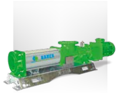
HELIX DRIVE Eccentric screw pump